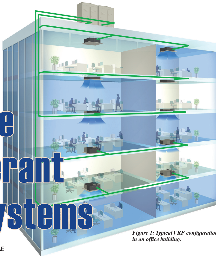
Figure 1: Typical VRF configuration in an office building.